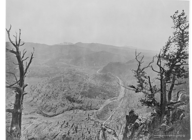
Big Bend River

For the first time since the winter snows have cleared there have been sightings of Indians South of Red River and around Big Bend. Locals report these are not the usual caravans trading between the tribes to the south and the Indian Nation West of Arkansas. Rather they seemed to be armed bands though local settlements report no confrontations with these men.